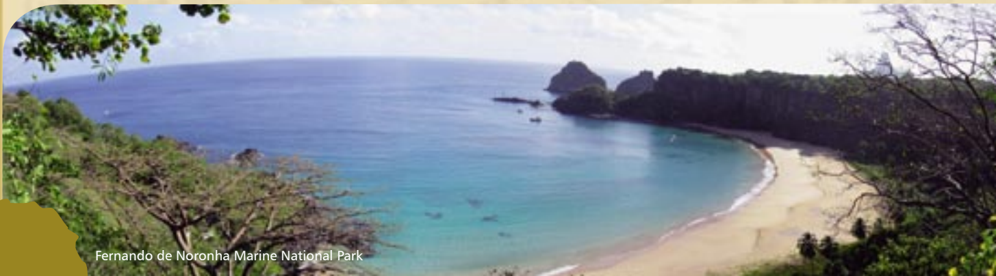
Fernando de Noronha Marine National Park

Our mission is to promote environmentally responsible travel in Brazil, ensuring that our natural resources and local communities benefit now and in the future. This mission demonstrates our belief that the true beauty of a nation and its people is reflected in the traveler's eyes.