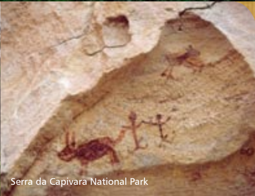
Serra da Capivara National Park