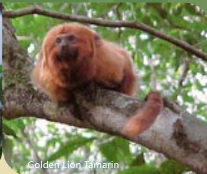
Golden Lion Tamarin