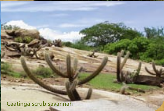
Caatinga scrub savannah