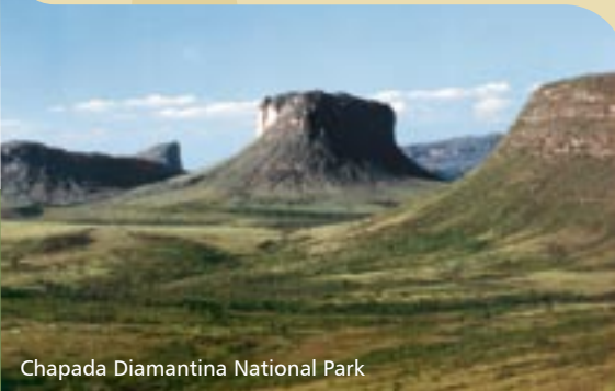
Chapada Diamantina National Park