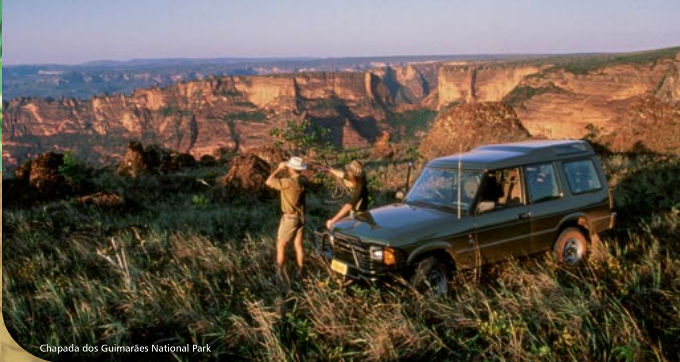
Chapada dos Guimarães National Park